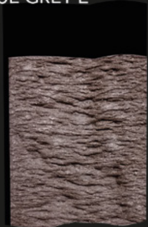
14/A DUBAI BROWN